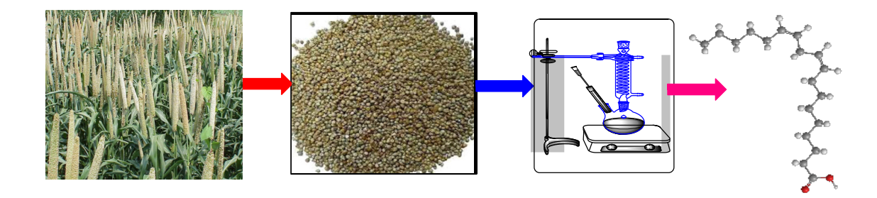
Figure 2 Stages of sorghum processing to identify secondary metabolites

Sorghum is used in food and feed production, in wallboards, fences, biodegradable packing material, as well as for ethanol production [22, 23]. According to the data in [24], before the outbreak of COVID-19, the trend in the world sorghum production from 2012 to 2019 fluctuated between 57 to 59 million tons (Fig. 1). Based on the world sorghum production data, there was a drastic increase in 2015 which was as a result of the increaseB sorghum usage by the Chinese in livestock feed meal. This made them to purchase large volumes of sorghum from the USA.